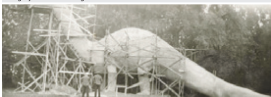
“Dinny the Dinosaur under construction at zoo, Calgary, Alberta,” 1937, (CU1225525) by Unknown. Courtesy of Glenbow Library and Archives Collection, Libraries and Cultural Resources Digital Collections, University of Calgary. https://digitalcollections.ualgary.ca/asset-management/2R3BF1O8Q5OQ .