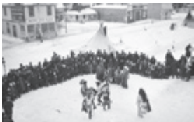
"Stoney at Banff Carnival, Banff, Alberta," 1922