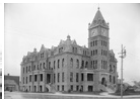
“City Hall, Calgary, Alberta,” [ca. 1911], (CU169103) by Unknown. Courtesy of Glenbow Library and Archives Collection, Libraries and Cultural Resources Digital Collections, University of Calgary. https://digitalcollections.ualgary.ca/asset-management/2R3BF1SLYACF?WS=SearchResults .