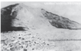
"View of Turtle mountain and slide area, Frank, Alberta," [ca. 1903], (CU1104678) by Unknown. Courtesy of Glenbow Library and Archives Collection, Libraries and Cultural Resources Digital Collections, University of Calgary. https://digitalcollections.ucalgary.ca/asset-management/2R3BF1F1MFB1?WS=SearchResults .