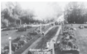
"Entry to St. George's Island, Calgary, Alberta," [ca. early 1920s], (CU1104276) by McDermid Photo Laboratories. Courtesy of Glenbow Library and Archives Collection, Libraries and Cultural Resources Digital Collections, University of Calgary. https://digitalcollections.ucalgary.ca/asset-management/2R3BF1XZKVOH .