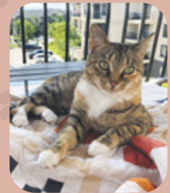
Willow, McKenzie Towne

To have your pet featured, email news@mycalgary.com