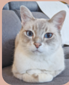
Tigger, Elbow Scene