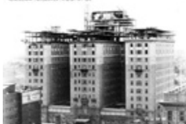
“Palliser Hotel, Calgary, Alberta,” 1929-06-20, (CU1101121)