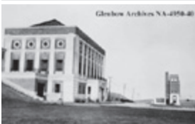
"Filtration plant, Glenmore dam, Calgary, Alberta," [ca. 1938], (CU1130063) by Unknown. Courtesy of Glenbow Library and Archives Collection, Libraries and Cultural Resources Digital Collections, University of Calgary. https://digitalcollections.ucalgary.ca/asset-management/2R3BF1FP1RIS?WS=SearchResults .