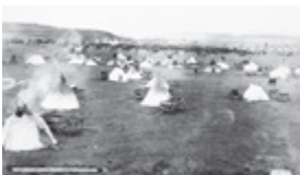
"First Nations camp, Shaganappi Point, Calgary, Alberta," 1901, (CU1125950) by Notman. Courtesy of Glenbow Library and Archives Collection, Libraries and Cultural Resources Digital Collections, University of Calgary. Please credit Notman Archives, McCord Museum. On occasion of Royal Visit of Duke and Duchess of Cornwall and York. https://digitalcollections.ucalgary.ca/asset-management/2R3BF1O8XTG9?WS=SearchResults .