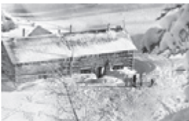
"Sunshine ski lodge, Simpson Pass, Alberta," [ca. 1936-1937], (CU1118448)