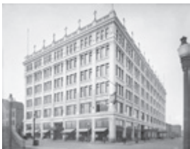
"Hudson's Bay Company Department Store, Calgary, Alberta," 1917, (CU166208)