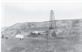
"View of Dingman #1 (Calgary Petroleum Products #1) well, Turner Valley, Alberta," 1914