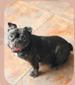
Molly, Elbow Scene