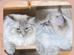
Spook and TenSoon, Crescent Heights

To have your pet featured, email news@mycalgary.com