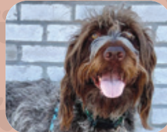
Otto, Crescent Heights