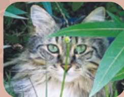
Luna, Canyon Meadows