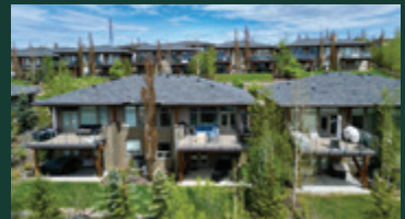
93 Watermark Villas SOLD