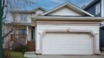
126 Rocky Ridge Drive NW SOLD