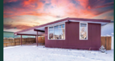
2307 54 Avenue SW SOLD