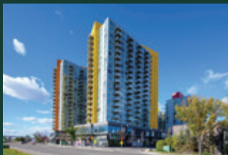
312, 3820 Brentwood Road NW $269,900