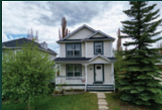
125 Tuscany Drive NW SOLD