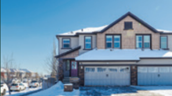
96 Sage Hill Point NW SOLD