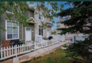
328 Toscana Gardens NW $459,900