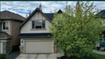
151 Tuscany Estates Close NW $1,050,000