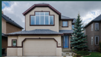
59 Tuscany Glen Place NW $1,200,000