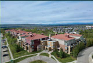
1307, 10221 Tuscany Blvd NW $574,900