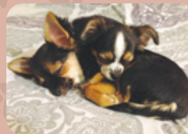
Tiger and Lily, Evanston

To have your pet featured, email news@mycalgary.com