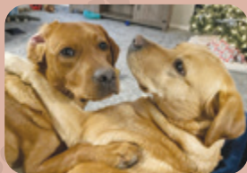
Lake and London, Cranston