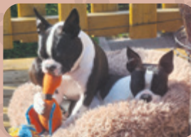
Thor and Loki, Shawnessy