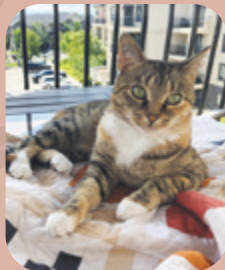
Willow, McKenzie Towne

To have your pet featured, email news@mycalgary.com