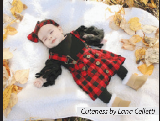
Cuteness by Lana Celletti