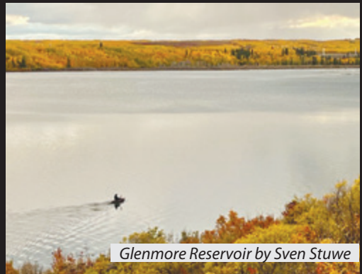
Glenmore Reservoir by Sven Stuwe