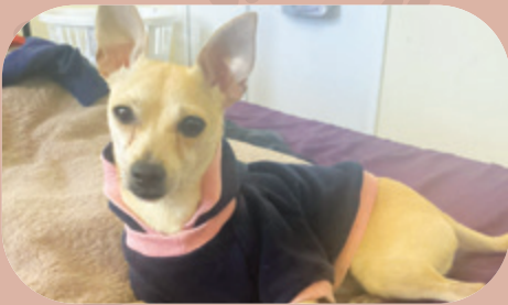
Sparky, Douglas Glen

To have your pet featured, email news@mycalgary.com