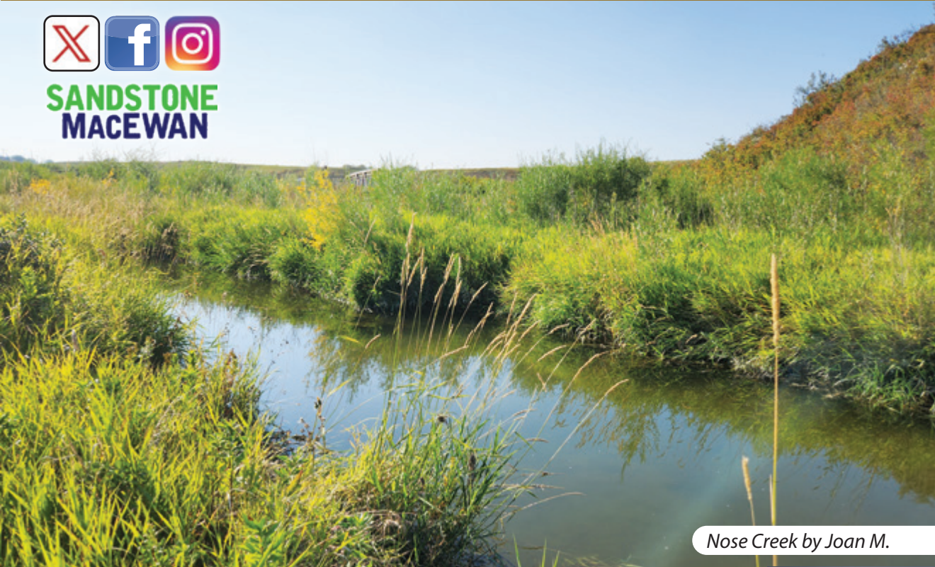
Nose Creek