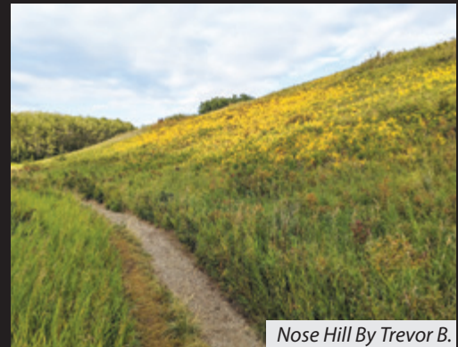
Nose Hill