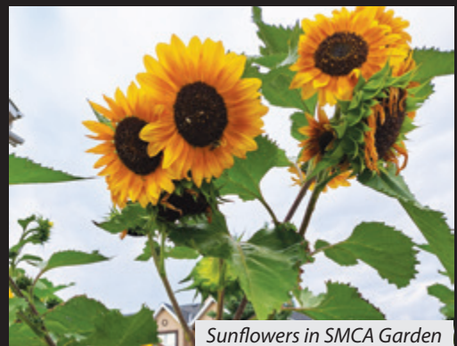
Sunflowers in SMCA Garden