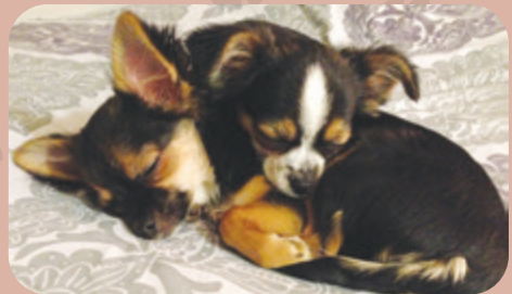
Tiger and Lily, Evanston

To have your pet featured, email news@mycalgary.com