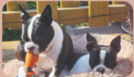
Thor and Loki, Shawnessy