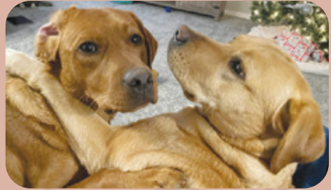
Lake and London, Cranston