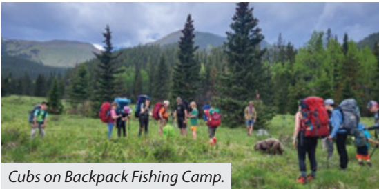
Cubs on Backpack Fishing Camp.

Thanks to everyone who participated in our bottle drives and other fundraisers. Next year's fundraiser campaigns