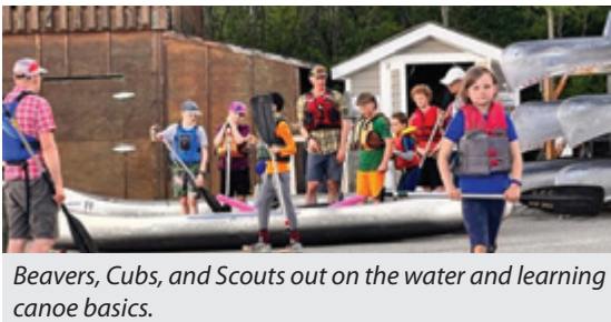
Beavers, Cubs, and Scouts out on the water and learning canoe basics.

are planned out below. Funds raised offset programs costs, so kids get outside and do what kids need to do!