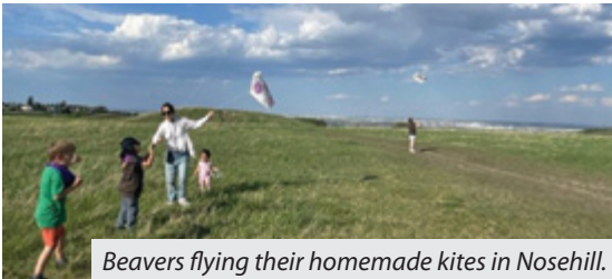
Beavers flying their homemade kites in Nosehill.