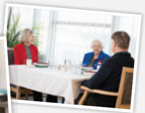
Daily dining in the company of new friends

Availability for certain floor plans is becoming limited. Don't miss out! Call now for the best selection of private suites.