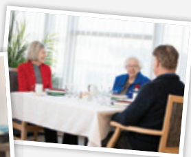
Daily dining in the company of new friends

Availability for certain floor plans is becoming limited. Don't miss out! Call now for the best selection of private suites.