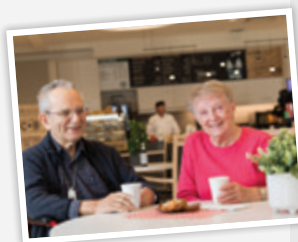
Treat yourself at the Bistro