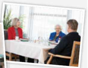
Daily dining in the company of new friends

Availability for certain floor plans is becoming limited. Don't miss out! Call now for the best selection of private suites.