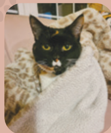
Icy, North Glenmore Park