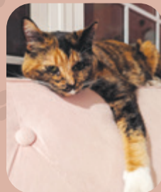
Millie, North Glenmore Park

To have your pet featured, email news@mycalgary.com