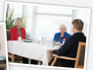
Daily dining in the company of new friends