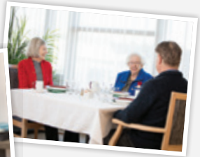
Daily dining in the company of new friends

Availability for certain floor plans is becoming limited. Don't miss out! Call now for the best selection of private suites.