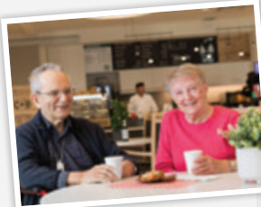
Treat yourself at the Bistro