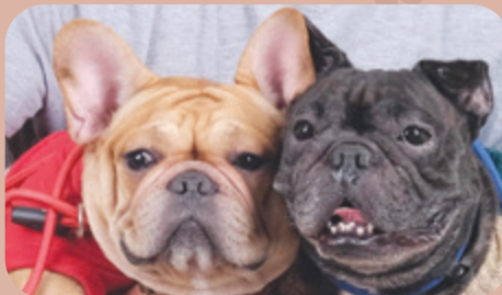
Basha and Molly, Elbow Scene