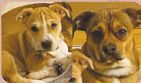
Tucker and Bentley, McKenzie Towne

To have your pet featured, email news@mycalgary.com