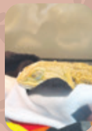
Puff the Magic Dragon, McKenzie Towne