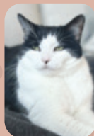
Tita, New Brighton

To have your pet featured, email news@mycalgary.com