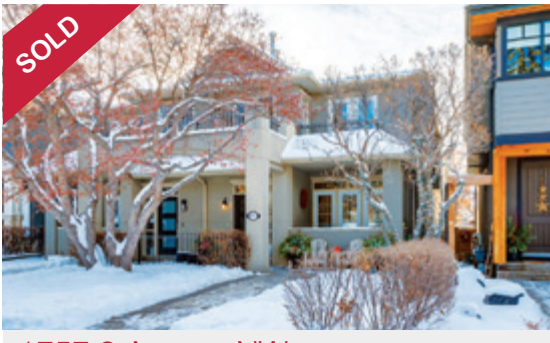
1757 8 Avenue NW

Experience the tranquility of empty nest living in this inviting home, featuring a South-facing backyard on a sought-after street.