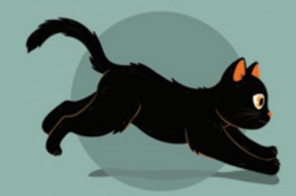
The sneaky cat managed to absquatulate any time the door was open.