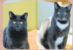
Sir Gawain and Sir Tristan, Woodbine

To have your pet featured, email news@mycalgary.com