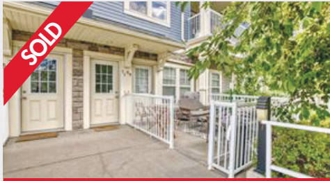
69 AUBURN BAY COMMON SE ~ $210,000

#80 RE/MAX Agent in Western Canada - 2022