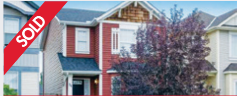
14 AUTUMN CR SE

Many homes are selling in under a month for top dollar! We are still seeing most of the Auburn Bay inventory selling VERY quickly. If you want specific information on your home or neighbouring homes... call or text me anytime to chat about the Auburn Bay market and I'd be happy to answer any of your questions."