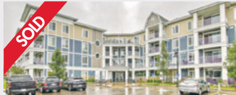
#222, 110 AUBURN MEADOWS VIEW SE ~ $346,000

Represented buyers on this beautiful home!