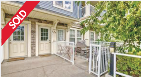
69 AUBURN BAY COMMON SE ~ $210,000

#80 RE/MAX Agent in Western Canada - 2022