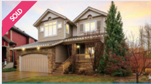
55 AUBURN SOUND MANOR SE

This top floor unit has sweeping mountain views! There is 1 bedroom and a den inside the unit, and loads of upgrades! The kitchen features stainless steel appliances, quartz countertops and subway tiled backsplash. The living room is spacious and has the best views ever! The bedroom also enjoys the mountain views. There is also in-suite laundry, tiled underground parking, and a storage locker – all in a great building in a perfect location!