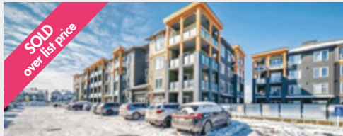
406, 150 AUBURN MEADOWS MANOR SE

This bungalow unit is neat and tidy and has 2 bedrooms, 1 full bathroom, open concept, stainless steel appliances in the kitchen that also has a pantry, quartz countertops, tiled backsplash and upgraded lights. There is also a double attached garage, plenty of storage space, overlooks the greenspace, close to the lake, hospital, YMCA and so much more!