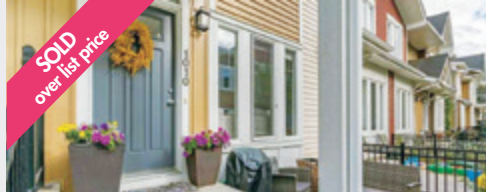
1010 AUBURN BAY SQUARE SE

This well located duplex has it all! Newly finished basement, detached double garage, 4 bedrooms, 3.5 bathrooms, front flex room/den, upgraded kitchen with a corner pantry, quartz counter tops and a gas stove! All this and almost 1,500 sqft! Great location just steps to a playground and a short trip to the year-round lake, local amenities and so much more!