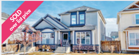
70 AUTUMN GREEN SE

If you are looking for real estate help, call me! I have helped almost 1,000 families achieve their real estate dreams since 1998.