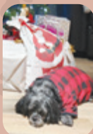
Charlie, Diamond Cove