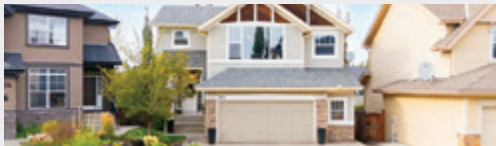
20 AUBURN SOUND TERRACE SE ~ $925,000

Come and check out your new home in a wonderful location close to schools, parks, playgrounds and the LAKE! 3 bedrooms, 3 bathrooms, just under 1400 sq ft above grade and you also have an unfinished basement to add more square footage to your new home! Beautiful open floor plan with a kitchen at the back of the house that features granite countertops, ample cabinet space and stainless steel appliances incl. a gas stove! Upstairs you have 3 bedrooms and another full bathroom for the kids! Outside there is a large detached garage and a low maintenance yard! Come and check this one out!