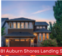
181 Auburn Shores Landing SE