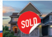
5 Mahogany Manor SE