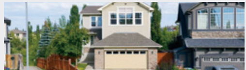
155 AUTUMN CLOSE SE ~ $980,000

This is an amazing home in a perfect location just a short walk to the LAKE and located in a quiet cul-de-sac! This home has a fully finished walkout basement, 4 bedrooms, 4 bathrooms, chef's kitchen, lots of upgrades and a bonus room/office combo upstairs! Great floor plan, plenty of natural sunlight, Central A/C, salt water hot tub, awesome yard and so much more in this beautiful property!