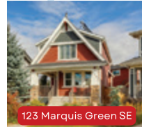
123 Marquis Green SE