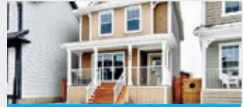
388 AUBURN CREST WAY SE ~ $600,000

PRIME cul-de-sac location with an awesome pie shaped lot with tons of privacy! This home has it all - over 2500 sqft of developed space, awesome sunny bonus room, new paint, new carpet, new appliances, newer shingles and furnace! Open floor plan that includes a main floor office, functional kitchen, corner gas fireplace and built in cabinets in the living room, upper laundry, great sized bedrooms and this home is so close to multiple schools, parks and playgrounds! Enjoy the lake lifestyle in this beautiful home!