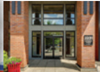
101, 2231 Mahogany Blvd SE

Wishing you Happy Holidays and a Happy New Year!!