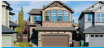
31 AUTUMN PLACE SE ~ $780,000

Welcome to this awesome townhouse that features 2 bedrooms (both with ensuite bathrooms), 2.5 bathrooms, quartz countertops, stainless steel appliances, tiled backsplash, upper laundry, amazing attic storage, private and fenced backyard, TWO parking stalls right outside your door, super low condo fees in an amazing complex so close to ALL the amenities in the area including the LAKE, Hospital, YMCA, dog park and so much more!