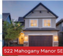
522 Mahogany Manor SE