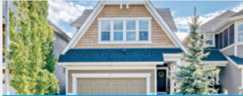
212 AUBURN MEADOWS CR. SE ~ $960,000

Welcome home to this IMMACULATE ground floor corner unit that features TWO bedrooms, TWO bathrooms, TWO parking stalls, A/C, and just under 1,000 sq ft! Wide open floor plan, tons of upgrades, quartz countertops, high end finishes! 9' ceilings, in-suite laundry, and a tandem parking stall. Close to ALL the amenities in the area and a short trip to the lake, hospital, YMCA, transit, schools, and SO MUCH MORE!