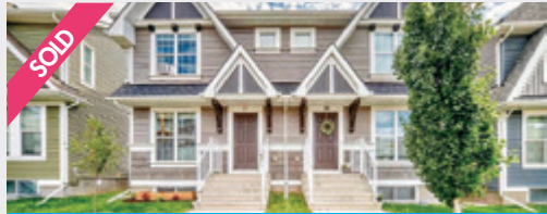
59 AUBURN MEADOWS HEATH SE ~ $550,000

This home is amazing! Backing onto the Prince of Peace school field and playground! South facing backyard, no neighbours behind, stunning upgrades in this home such as the double island, quartz countertops, chef's dream kitchen, 5 bedrooms, 4 bathrooms, over 3,300 sq ft of developed space, amazing location! 9' ceilings, spa-like ensuite with his and hers closets, A/C, upper level laundry room, and SO MUCH MORE in this beautiful home!