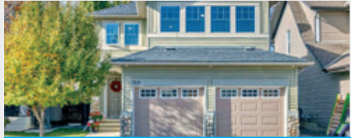
785 AUBURN BAY BLVD. SE ~ $710,000

Squeaky clean and ready for a new owner! This 3-bedroom duplex is perfectly located close to EVERYTHING! Updated kitchen with quartz countertops and stainless steel appliances, large living space on the main floor, primary bedroom with an ensuite bathroom and a walk-in closet, upper laundry, plenty of space for future development in the basement and room for a double garage in the back. Get into a premier lake community at an awesome price!