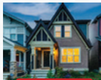
104 Masters Link SE