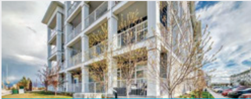
104, 500 AUBURN MEADOWS COMMON SE ~ $405,000

If you are looking for real estate help, call me! Since 1998, I have helped over 1,100 families achieve their real estate dreams. Over 165 homes sold in Auburn Bay, thank you!