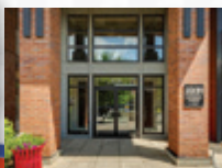
101, 2231 Mahogany Blvd SE

Check out our Living in Auburn Bay page for our next event in Auburn Bay