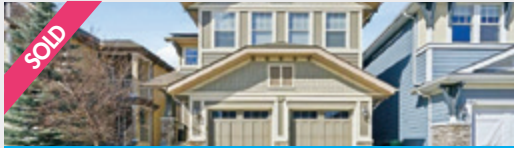
172 AUBURN BAY AVE SE ~ $1,075,000

If you are looking for real estate help, call me! Since 1998, I have helped over 1,200 families achieve their real estate dreams. Over 180 homes sold in Auburn Bay, thank you!