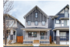
27 Masters Manor