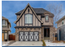
290 Mahogany Place