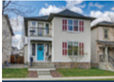
27 Elgin Terrace