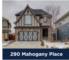
290 Mahogany Place