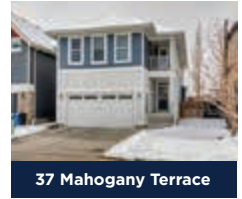
37 Mahogany Terrace