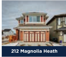
212 Magnolia Heath