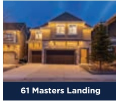
61 Masters Landing