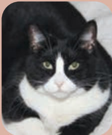
May, Elbow Park