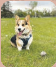
Moony, Lake Bonavista