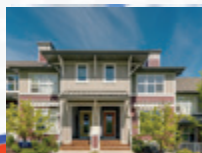
117 Marine Drive SE