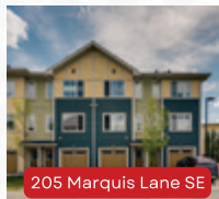
205 Marquis Lane SE