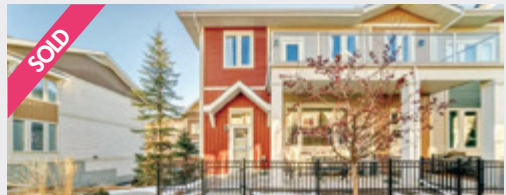
151 AUBURN MEADOWS WALK SE ~ $485,000

This home is amazing! Backing onto the Prince of Peace school field and playground! South facing backyard, no neighbours behind, stunning upgrades in this home such as the double island, quartz counters, chef's dream kitchen, 5 bedrooms, 4 bathrooms, over 3,300 sq ft of developed space, amazing location! 9' ceilings, spa-like ensuite with his and hers closets, A/C, upper level laundry room, and SO MUCH MORE in this beautiful home!