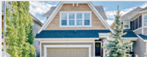
212 AUBURN MEADOWS CR. SE ~ $960,000

Over 2,200 sq ft above grade, directly across from a school and playground/park! This home features 3 bedrooms and 3 bathrooms, A/C, cork flooring, main floor office space, bonus room, granite countertops, black appliances, gas fireplace, walk through pantry, and is immaculately maintained! The yard is a great place to relax and is very private, and you will love the stamped concrete patio in the yard, heated garage with 220V, and so much more!