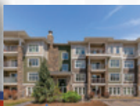
1102, 11 Mahogany Row SE

Check out our Living in Auburn Bay page for our next event in Auburn Bay