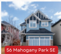
56 Mahogany Park SE