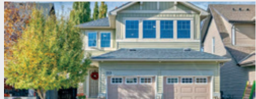
785 AUBURN BAY BLVD SE ~ 730,000

Welcome home to this IMMACULATE ground floor corner unit that features TWO bedrooms, TWO bathrooms, TWO parking stalls, A/C, and just under 1,000 sq ft! Wide open floor plan, tons of upgrades, quartz countertops, high end finishes! 9' ceilings, insuite laundry, and a tandem parking stall. Close to ALL the amenities in the area and a short trip to the lake, hospital, YMCA, transit, schools, and SO MUCH MORE!