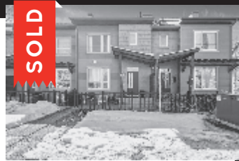
81 Chapalina Square SE