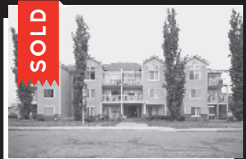
7720 39 Avenue NW #1