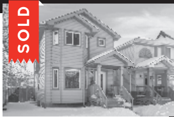
172 Chaparral Ridge Circ SE