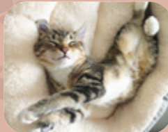
Ravioli, Lower Mount Royal