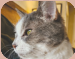
Squeeks, Mount Pleasant