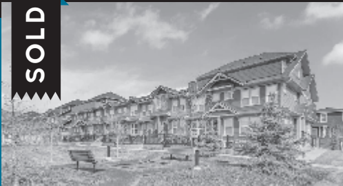
114 Cranbrook Square SE