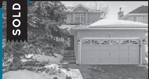
158 Mt Assiniboine Circle SE