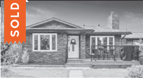
20 SUNHURST PLACE SE