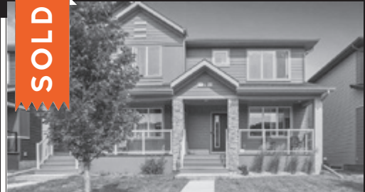
52 WOLF CREEK DRIVE SE