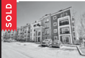
99 Copperstone Park SE

Stats current as of June 1, 2024 @ 11:59 pm. For more detailed market sales information, please contact Team Palmer at 403.836.3018 or info@teampalmer.ca.