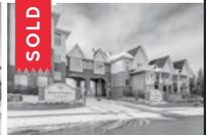
15 Everstone Dr. SW # 107