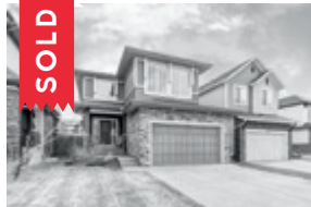
464 Legacy Boulevard SE