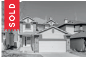
128 Chaparral Circle SE