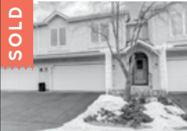
61 Sunlake Gardens SE

Stats current as of March 31, 2024 @ 11:59 pm. For more detailed market sales information, please contact Team Palmer at 403.836.3018 or info@teampalmer.ca.