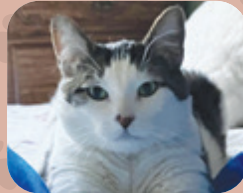
Starr, Lake Chaparral