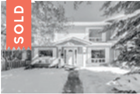
59 Midvalley Rise SE