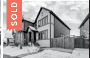
279 Marine Drive SE