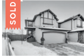
142 New Brighton Circle SE