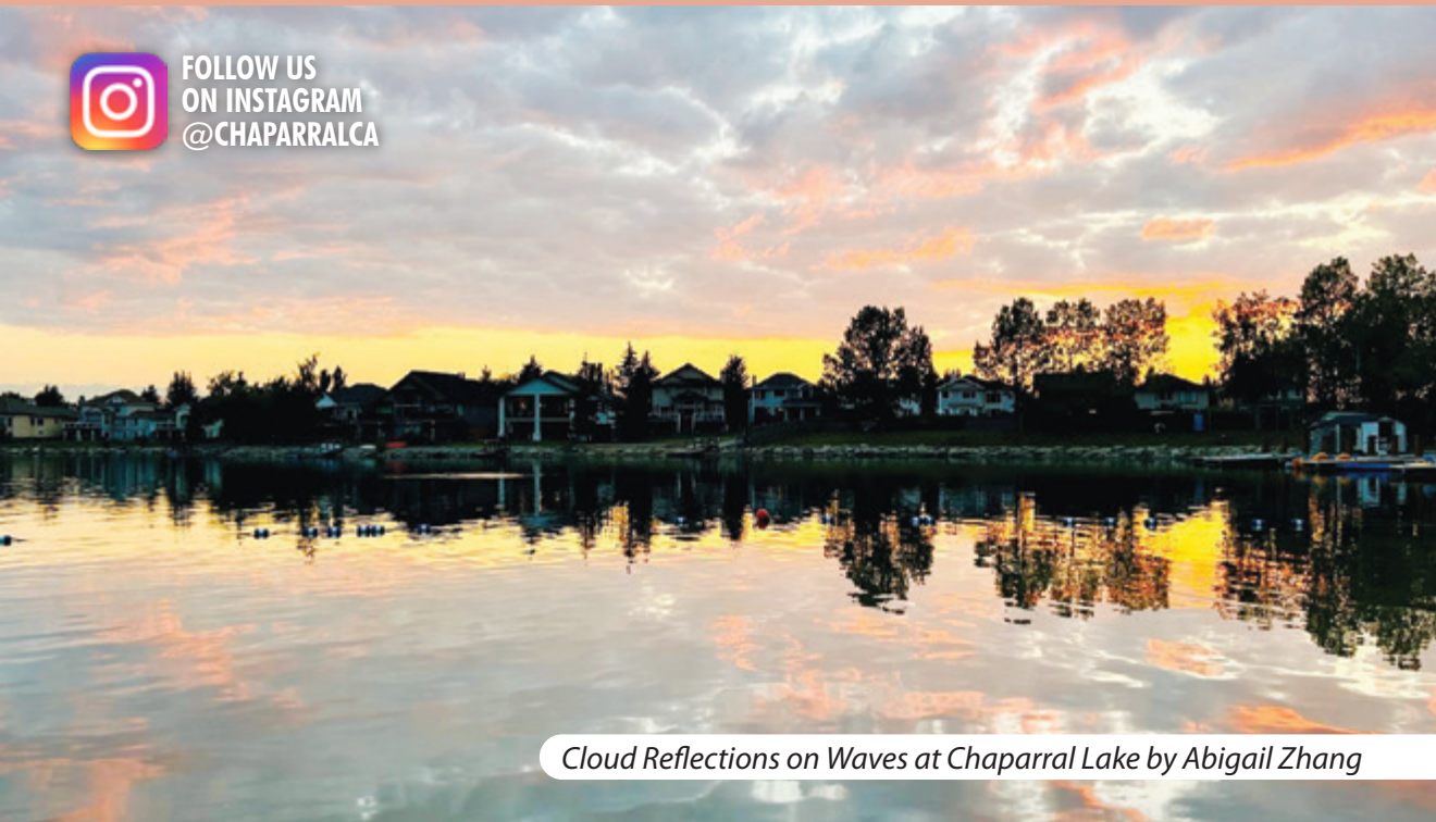
Cloud Reflections on Waves at Chaparral Lake by Abigail Zhang