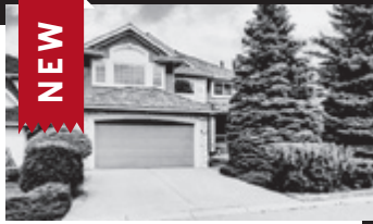
117 Evergreen Way SW

Stats current as of September 30, 2024 @ 11:59 pm. For more detailed market sales information, please contact Team Palmer at 403.836.3018 or info@teampalmer.ca.