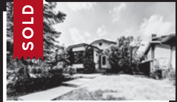
17019 Sunvale Road SE