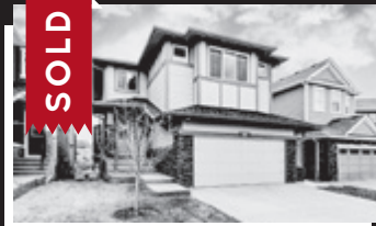
24 Legacy Manor SE