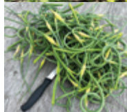
Ready to harvest the scapes later.

On June 28, I harvested 86 garlic scapes—about two weeks earlier than last year. I left around ten to grow a bit longer. I like to harvest scapes once they've formed a full curl but before the flower begins to develop. Waiting too long can make them woody and overly pungent.