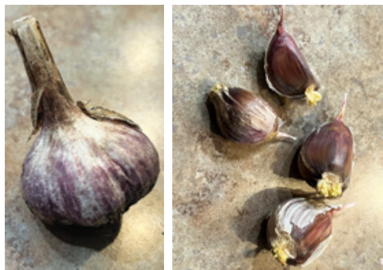
Still looks good, over 10 months.