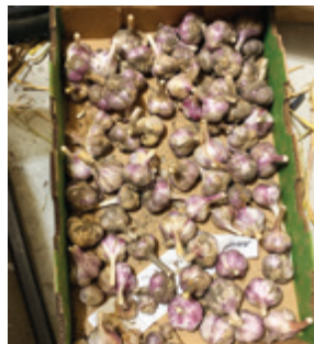
Trimmed and ready.