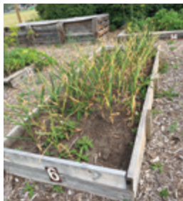
Getting ready to harvest.

The rest becomes garlic scape pesto, blended with toasted nuts (pecans are our favourite), parmesan, basil, oil, salt, and a splash of lemon juice. This, too, is frozen flat and enjoyed year-round—a little taste of summer in every bite.