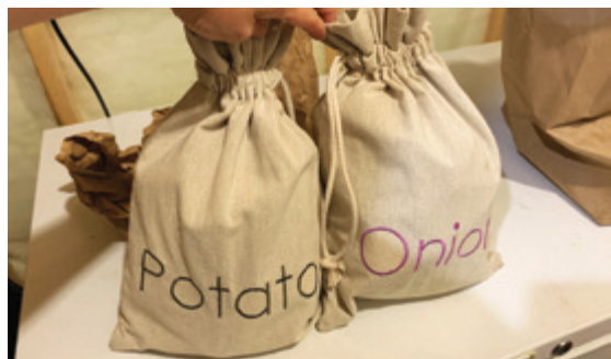
Tucked away for the winter.

Email us at chaparralgreenthumbs@gmail.com .