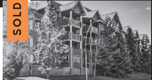
#3414 - 3000 Millrise Point SW