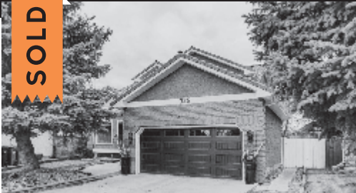
325 Woodbriar Place SW