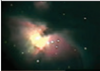
Orion nebula: through two panes of glass

Yes, I am well aware that hardcore astronomers would not recommend this approach as the multiple panes of glass will distort the image somewhat. But if the alternative is no stargazing at all, I think you'll be pleasantly surprised by what you can see while sitting next to a window. While the images won't be Hubble quality, they can still be pretty darn impressive.