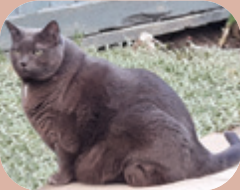
Big Earl, Capitol Hill