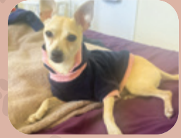
Sparky, Douglas Glen

To have your pet featured, email news@mycalgary.com