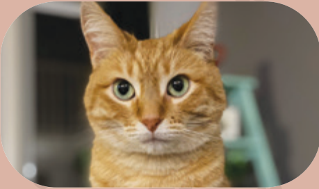
Crouton, Signal Hill