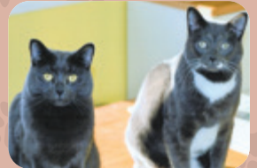
Sir Gawain and Sir Tristan, Woodbine

To have your pet featured, email news@mycalgary.com