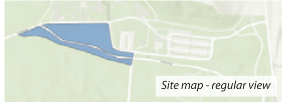
Site map - regular view

mix. The Listen Garden will also feature several "Habitat beds" that highlight Alberta's diverse ecosystems. Beds on the garden's west side will showcase alpine/montane, foothills parkland, and Foothills rough fescue grassland ecosystems, merging into the dry mixed grass and badlands ecosystems on the east side of the gardens. These more "formal" gardens will be installed in a few years. Right now, the space consists of contoured pathways – what isn't currently path will be a home for thousands of tiny native plant seedlings.