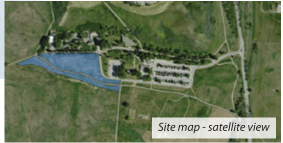
Site map - satellite view

And this year, we've got a special purpose for all those seeds we're harvesting – putting them into the Listen Garden at Bow Valley Ranch – a space for native plants, Indigenous knowledge, and reconciliation. This area has been treated with herbicide to remove the invasive species that cover much of the park and prepare it for the cover crop (annual Plains coreopsis) and native seed mix we'll apply in spring. After one to two seasons, the Plains coreopsis will die, and the high-diversity native seed mix will emerge from below. To speed revegetation along, hundreds of large, salvaged mature plants like Foothills rough fescue, Parry's oatgrass, and Western porcupine grass will be planted in the spring alongside the seed