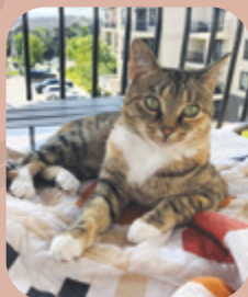
Willow, McKenzie Towne

To have your pet featured, email news@mycalgary.com