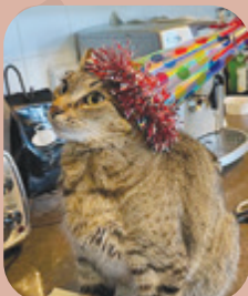
Sugar, Signal Hill