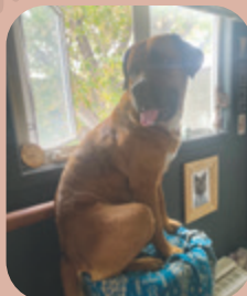
Poppy, Tuxedo Park