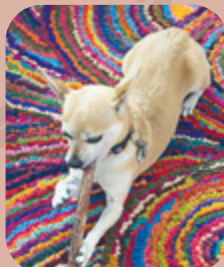
Todd, Lake Chaparral

To have your pet featured, email news@mycalgary.com