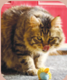
Dobby, Huntersen Place