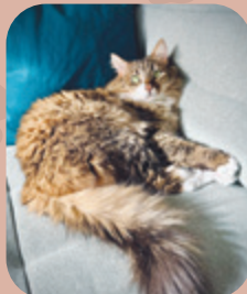
Guzel, Huntersen Place