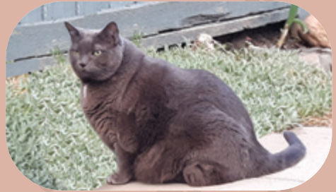
Big Earl, Capitol Hill