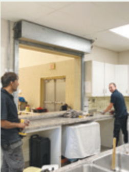
New kitchen deconstruction