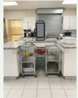
Kitchen island before