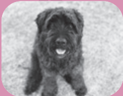
Bisous, Deer Run