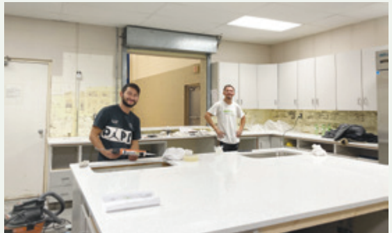
Kitchen island after