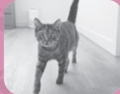
Nacho, Panorama Hills