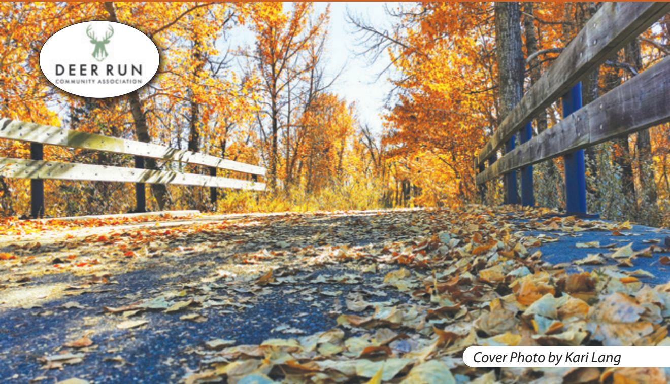
Cover Photo by Kari Lang