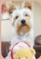
Louie, Panorama Country Hills