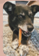
Mystery, Christie Park