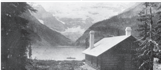
"The first Lake Louise Chalet, Lake Louise, Alberta," [ca. 1890-1893], (CU185533).