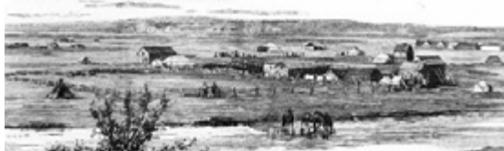
"Calgary, Alberta., 1884-11-08, (CU181590)

*All copyright images cannot be shared without prior permission.