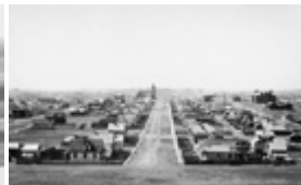
"Bridgeland area, Calgary, Alberta., [ca. 1912-1915], (CU140825) https://digitalcollections.ucalgary.ca/asset-management/2R3BF11WVC9?WS=SearchResults.