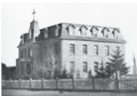
"Sacred Heart Convent, Calgary, Alberta," [ca. 1900-1905], (CU1156653)