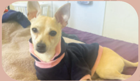
Sparky, Douglas Glen

To have your pet featured, email news@mycalgary.com