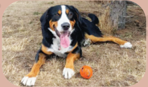
Moose, Canyon Meadows