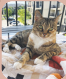
Willow, McKenzie Towne

To have your pet featured, email news@mycalgary.com